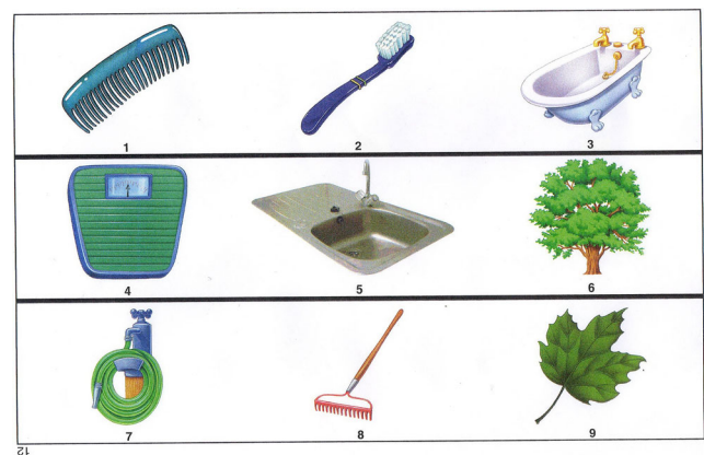
Fig. 1 Example trial from the Picture Concept Task. The subject has to identify the common association between one item from each row